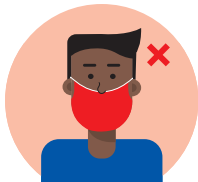
Ffroeni | The sniffer