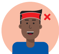
Band gwallt | The headband