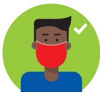
Cywir | Correct

You must wear a face covering on the train for the duration of your journey.