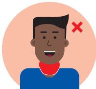
Cynhesu'r gwddf | The neck warmer