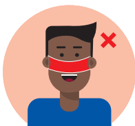
Gwenu | The smiler