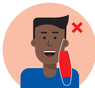
Clustdlws | The earring

O beidio â gwisgo gorchudd wyneb, mae'n bosib na ganiateir i chi barhau â'ch taith.