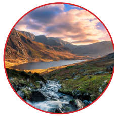
Environment (Wales) Act 2016

Our Sustainable Development Plan is influenced by a wide range of relevant legislation and policies which guide us in achieving our goals, including: