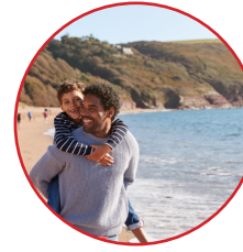
Well-being future generations (Wales) Act 2015