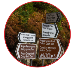
Welsh Language (Wales) Measure 2011