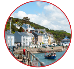
Social Partnership and Public Procurement (Wales) Bill 2022