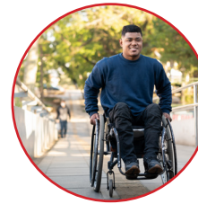
The Equality Act 2010 (Statutory Duties) (Wales) Regulations 2011